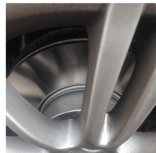
With Corrosion Protection