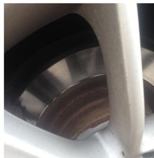
Without Corrosion Protection