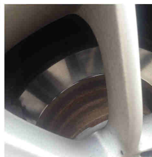
Without Corrosion Protection